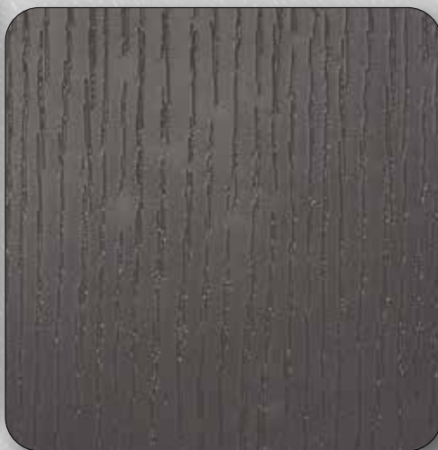
PORO LACCATO TRAVERSO